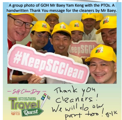
A group photo of GOH Mr Baey Yam Keng with the PTOs. A handwritten Thank You message for the cleaners by Mr Baey.

The event was flagged off by Guest-of-Honour Senior Parliamentary Secretary for Sustainability and the Environment, Mr Baey Yam Keng outside Tampines MRT Station. Participants then travelled to Pasir Ris Bus Interchange, Paya Lebar MRT Station, Serangoon MRT Station, Bishan Bus Interchange, Woodlands Integrated Hub and Jurong East Bus Interchange to take on the various Public Cleanliness challenges that were posed to participants. These included booth activities that emphasized on binning our trash, keeping public toilets clean, returning food trays and also appreciating our public cleaners. Alongside the booth activities, participants were treated to entertainment and performances by guest DJs from 987FM and YES 933 on this fun-filled Sunday morning as they travelled around Singapore on public transport to test their knowledge and put into practice good public cleanliness habits.