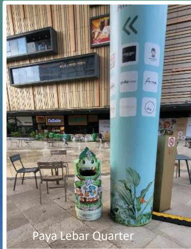
Paya Lebar Quarter