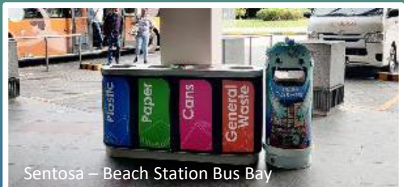
Sentosa – Beach Station Bus Bay