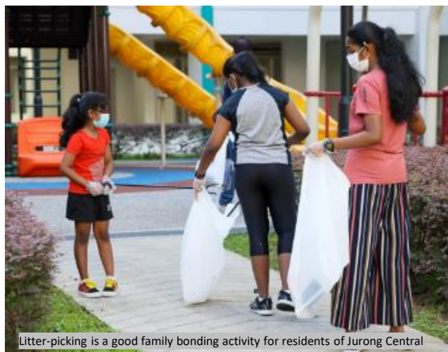
Litter-picking is a good family bonding activity for residents of Jurong Central