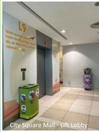
City Square Mall - Lift Lobby

All 10 winning entries from our “Feed My Trashemon” School Competition 2021 designed by our secondary school students were adopted by our corporate partners and displayed at their premises. Have you seen them around yet? Join us to thank our partners for supporting us in such a meaningful initiative to educate and inspire Singapore residents to take ownership and bin their trash responsibly.