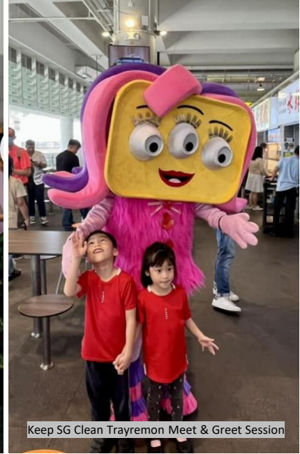
Keep SG Clean Trayremon Meet & Greet Session

We were invited to attend the official opening of One Punggol Hawker Centre by Timbre Group on Saturday, 25 March 2023. The event was graced by Senior Minister, Mr Teo Chee Hean and he is joined by his Pasir Ris – Punggol GRC members, Dr Janil Puthcheary, Ms Yeo Wan Ling and Mr Sharael Taha. Minister of State, Ms Sun Xueling was in attendance too.