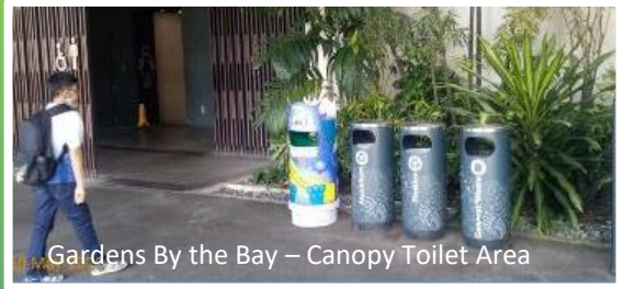
Gardens By the Bay – Canopy Toilet Area