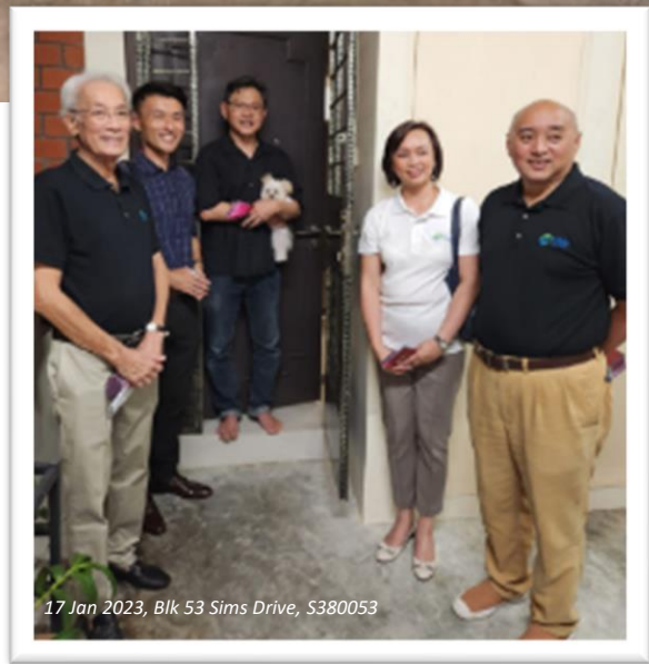
17 Jan 2023, Blk 53 Sims Drive, S380053

Through these visits, the PHC hopes to encourage more people to join in acting against this problem as a community, so that there would be more positive changes for the environment.