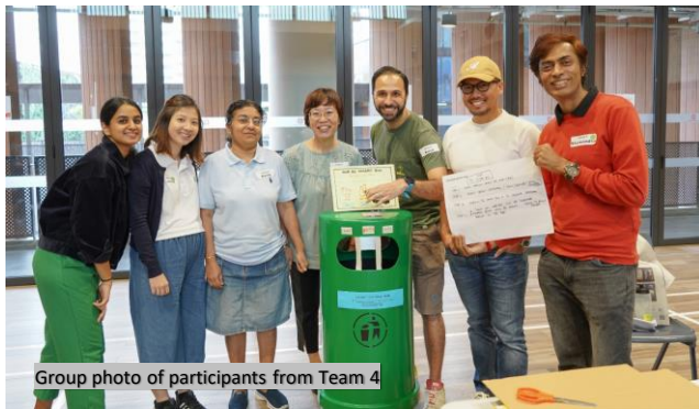
Group photo of participants from Team 4