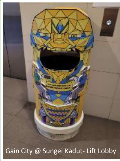
Gain City @ Sungei Kadut- Lift Lobby