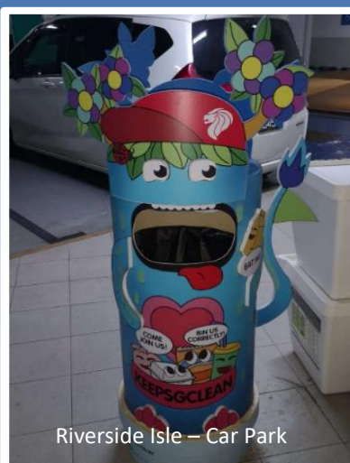
Riverside Isle – Car Park