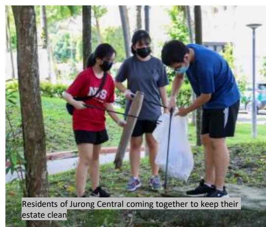
Residents of Jurong Central coming together to keep their estate clean