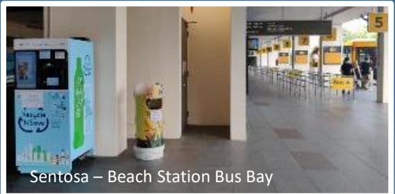
Sentosa – Beach Station Bus Bay