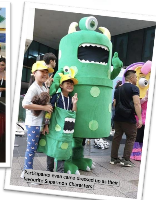
Participants even came dressed up as their favourite Superman Characters!

Our first quarterly SG Clean Day of 2023 was held on Sunday, 12 February and it was organised in conjunction with the inaugural Travel Quest – Let's Go Places, Let's Clean Spaces. It was an event with public cleanliness-themed challenges held at various public transport nodes around the island supported by Singapore's four public transport operators. SG Clean Day Travel Quest was supported by the Land Transport Authority and all public transport operators in Singapore.