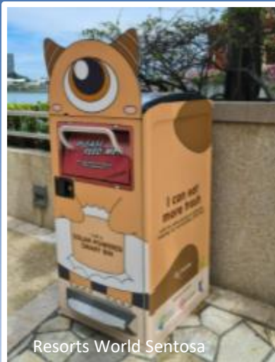
Resorts World Sentosa