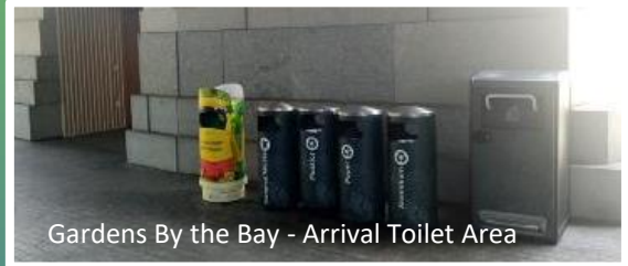
Gardens By the Bay - Arrival Toilet Area