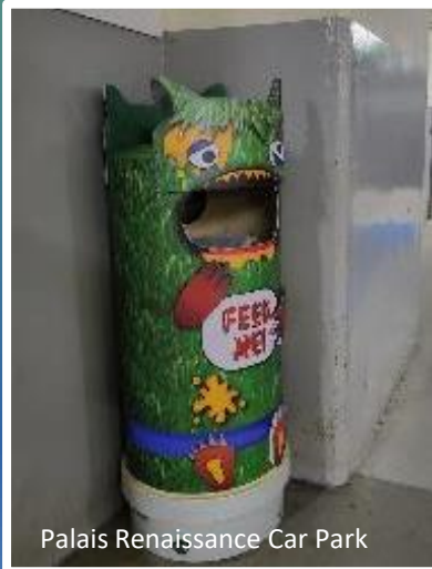
Palais Renaissance Car Park