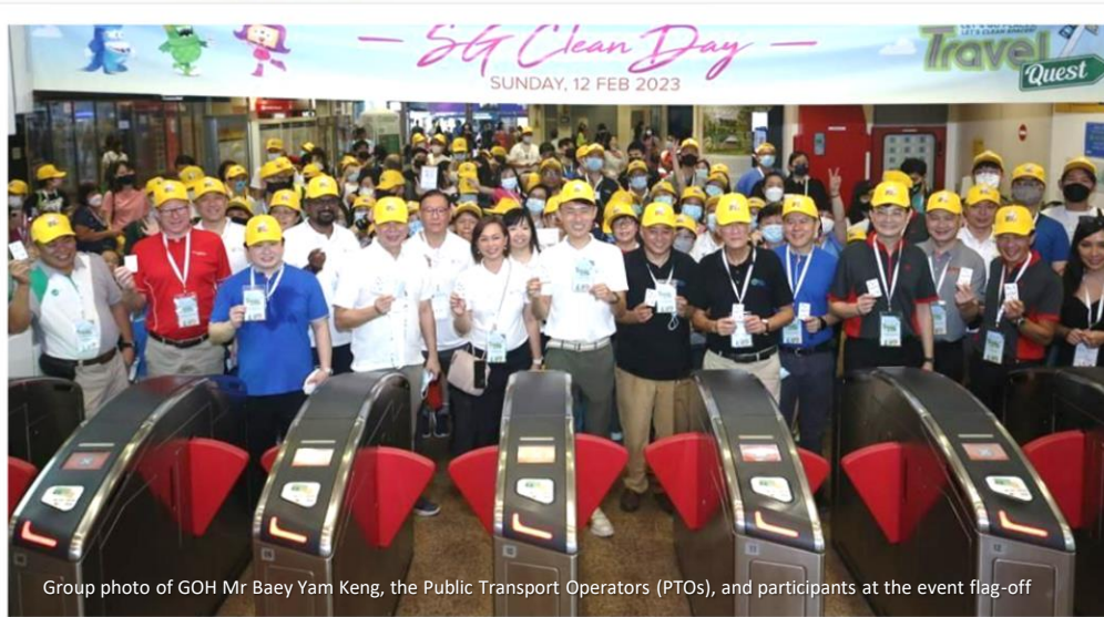
Group photo of GOH Mr Baey Yam Keng, the Public Transport Operators (PTOs), and participants at the event flag-off