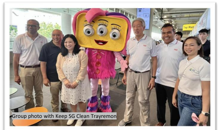
Group photo with Keep SG Clean Trayremon

Keep SG Clean Trayremon was invited to attend the event to remind and encourage Punggol residents to follow her lead and return their trays after their meals. Trayremon was well received by young children who took turns to take photos with her at the hawker centre during her walkabout.