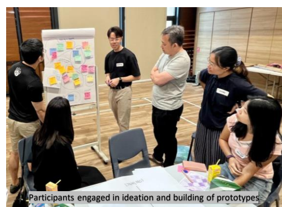
Participants engaged in ideation and building of prototypes